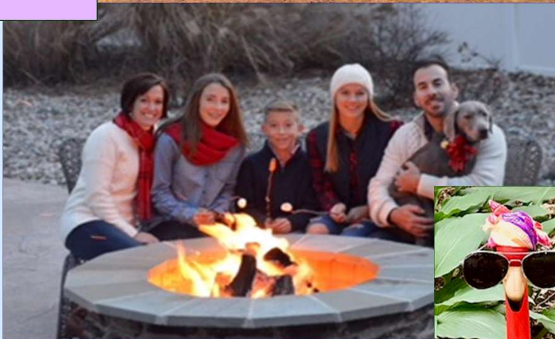
roasting marshmallows in the backyard