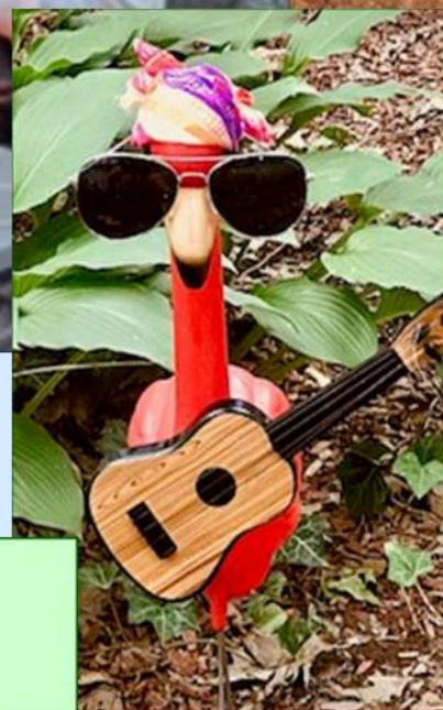
Kristi's camp mascot, Phil (the Flamingo).